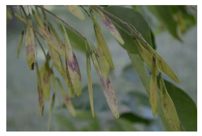
The pumpkin ash's winged seed or samara is eaten by birds.

Pumpkin, white and green ash trees are significantly threatened by infestations of the Asian insect, the emerald ash borer (EAB), Agrilus plannipesas , in our region. Arborists and foresters are tracking the movement of this species of borer eastward from the Midwest into northern Virginia and they confirmed an infestation in Fairfax County in 2008. Treatment for EAB consists of injecting an effective pesticide known as imadicloprid into individual healthy