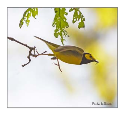
A Hooded warbler eats a fall cankerworm.

the Mount Vernon area near Dyke Marsh. Fortunately, the National Park Service does not allow cankerworm spraying on their properties.