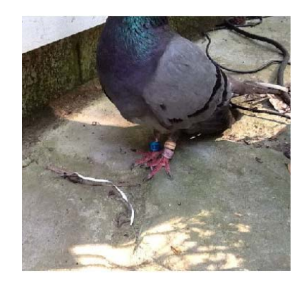
A racing pigeon with a numbered leg band.