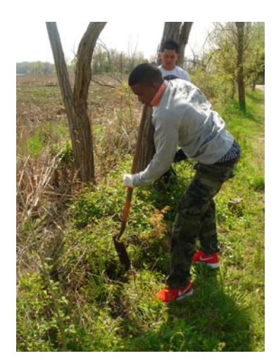
TCW students helped plant native species along the Haul Road.