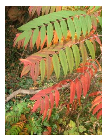
Compound leaves of smooth sumac can have 27 leaflets.

Staghorn sumac ( Rhus typhina or Rhus hirta ) is very similar to smooth sumac. The main way to distinguish between the two plants