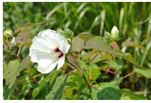
Crimson-eyed or swamp rose mallow ( hibiscus moscheutos ) blooms in Dyke Marsh.

For more information on wetlands, see the Fish and Wildlife Service's report to Congress on the status and trends of the nation's wetland resources, which can be found at http://www.fws.gov/wetlands/. Information about Virginia's wetlands can also be found at http://www.wetlandswatch.org/.