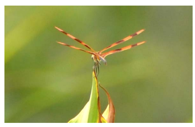
A Halloween Pennant ( Celithemis eponina ) displays its orange and black wings.

Libellula luctuosa Libellula pulchella Celithemis eponina Macromia sp.