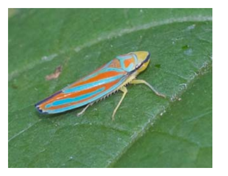
A Scarlet and Blue Leafhopper at Dyke Marsh.

Anyone can plant milkweed," Brindza said. "It's the best thing people can do." Monarch Watch's Taylor concurs. "To compensate for the continued loss of habitat we need to plant LOTS AND LOTS of milkweed," he wrote. "To assure a future for monarchs, conservation and restoration of milkweeds need to become a national priority."