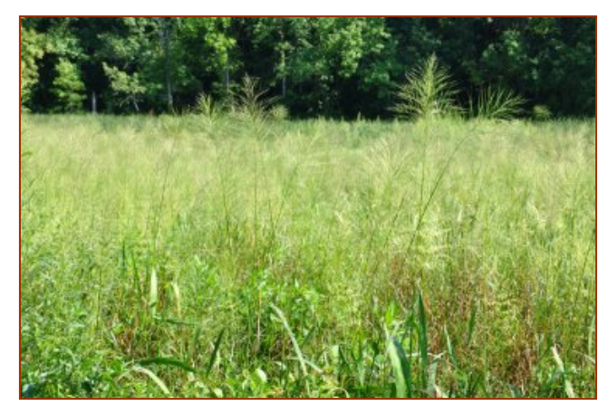
Wetland plants found in Dyke Marsh include Wild Rice ( zizania aquatica ).

The current list (along with historic lists and other information) can be found at http://rsgisias.crrel.usace.army.mil/NWPL/. Lists can be downloaded by state or by region. State lists may encompass multiple regions—for example, the list for Virginia has columns for both the Atlantic and Gulf Coastal Plain (AGCP) and Eastern Mountains and Piedmont (EMP) regions.