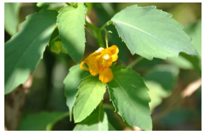
A plant species usually occurring in uplands is the Jewel-weed ( impatiens capensis ).

According to the question-and-answer document accompanying the announcement, no major changes to wetland delineation boundaries are expected as a result of the update. The update did result in changes to the indicator status for 12% of the species on the 1988 list, but there was nearly an equal split between species that received "wetter" ratings and species that received "drier" ratings.