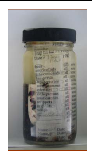
The last jar sorted.