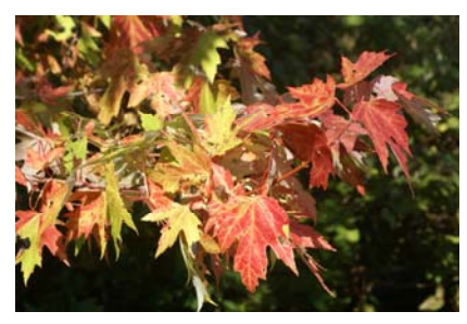
This Red Maple is turning yellow and solid red.

Marsh mallow capsules will open, drop their seeds, and remain as empty capsules all winter. Button bush round clusters of fruits will slowly fall to pieces, releasing their fruits to the water below. Wild rice will drop their mature grains and cattails will begin to release their small