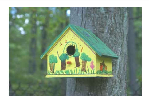
One of several birds houses included in the habitat.

tools and get in on the fun! And FOD-Mers are invited to the ribbon-cutting ceremony at 3:00 p.m. November 10 at the school.