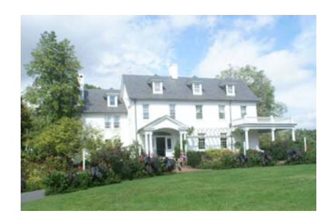
The American Horticultural Society's headquarters at River Farm, site of the celebration.

Chamberlayne, District Engineer, Baltimore District, U.S. Army Corps of Engineers