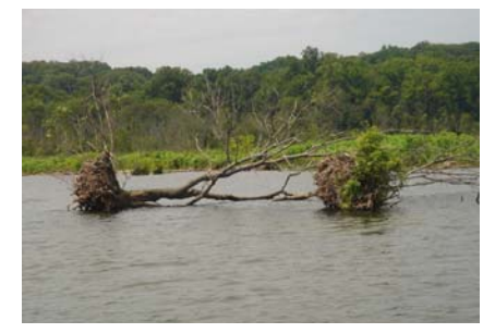
Fallen trees along the shoreline are one indication of erosion.

• Commercial dredging removed a forested promontory immediately south of the marsh. Eliminating the promontory,