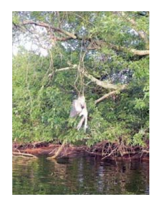
Great blue heron hanged by fishing line.