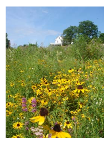
The André Bleumel Meadow at River Farm with AHS headquarters.

or recognize its value and fragility. It's not Yellowstone, it's not the Grand Canyon, but it is our little slice of wilderness