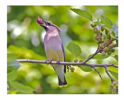
Cedar waxwing ( Bombycilla cedrorum ).

You can be a "citizen scientist" by participating in the annual National Societv's Audubon Christmas Bird Count. The Christmas Bird Count began in 1900 as an alternative to the holiday sport of shooting birds. Novices are welcome.