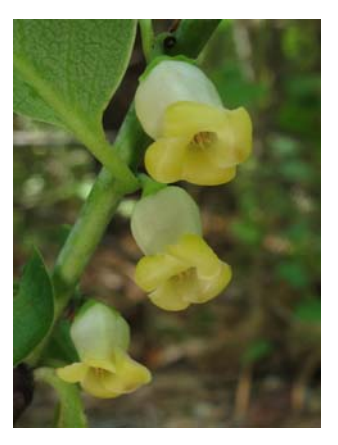
Staminate flowers of common persimmon.

tree's height ranges from 20 to 60 feet and its trunk diameter is typically 1-2 feet.