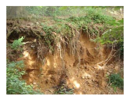
Severe streambank erosion in Mount Vernon Park sends sediment into Dyke Marsh during storms.

and out into Mount Vernon Park. The intensity and volume of the stormwater raging downhill over highly-erodible soils has sliced off huge "slugs" of soil. County officials say that the highly-eroded channel is 13 feet deep, more than 50 feet wide and 200 feet long. Some have dubbed it the "Grand Canyon." County officials say that massive amounts of sediment have moved downstream since 2005. Ironically, Mount Vernon Park has "one of the best quality forests in Fairfax County," say county officials.