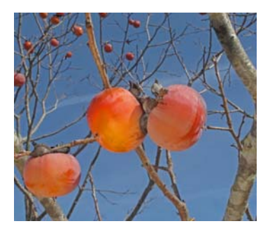
Ripe persimmon fruit.

The plum-like fruit is a berry 1-2 inches in diameter, starting out greenish and turning orange as it matures. Each fruit has 1-8 flat seeds. The fruit ripens in late autumn and can persist into winter. The im-