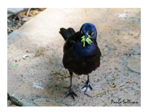
A common grackle gathers cankerworm caterpillars.

The Phenology Network encourages people to observe and record events like leaf out, flowering, migrations and egg laying to help researchers better understand how species and ecosystems are responding to global environmental change. Understanding phenology also