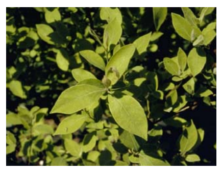
Spicebush leaves are egg-shaped.

Spicebush blooms in early spring (usually around March in our area), and the clusters of lemon-yellow flow-