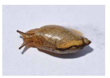
Oxyloma cf. effusum, a characteristic species of Dyke Marsh often found climbing high on cattails in the marsh.

through the shell as a white longitudinal stripe on the last shell whorl. This is probably the most commonly encountered snail in Dyke Marsh. It, along with C. vermeta, belongs to the family Succineidae, a group notoriously difficult to identify to species because of the similarities of shell morphology and anat-