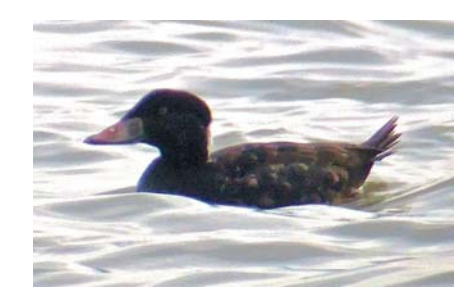
First record juvenile male Surf Scoter at Dyke Marsh.

The Surf Scoter, known colloquially as the "skunkheaded coot" because of the boldly patterned head and nape