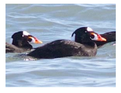
Male Surf Scoters in breeding plumage.

The most memorable bird for the entire DC Count was