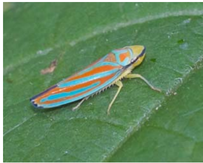
A Scarlet and Blue Leafhopper at Dyke Marsh.

"Anyone can plant milkweed," Brindza said. "It's the best thing people can do." Monarch Watch's Taylor concurs. "To compensate for the continued loss of habitat we need to plant LOTS AND LOTS of milkweed," he wrote. "To assure a future for monarchs, conservation and restoration of milkweeds need to become a national priority."