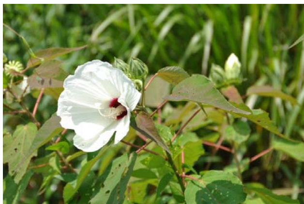
Crimson-eyed or swamp rose mallow ( hibiscus moscheutos ) blooms in Dyke Marsh.

For more information on wetlands, see the Fish and Wildlife Service's report to Congress on the status and trends of the nation's wetland resources, which can be found at http://www.fws.gov/wetlands/ . Information about Virginia's wetlands can also be found at http://www.wetlandswatch.org/ .