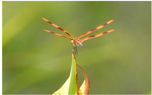
A Halloween Pennant ( Celithemis eponina ) displays its orange and black wings.

Dragonflies and damselflies are in the order Odonata. These insects have two pairs of wings and three pairs of legs, among other characteristics. Dragonflies typically spread their wings to their sides when they land and are typically larger and more robust. Damselflies are usually smaller and they typically hold their wings together over their abdomen. Their eyes are separated. To identify specific species, experts study their wings, wing patterns, colors, tail, thorax, abdomen, genitalia and other features, some under a microscope. Some have bright, lustrous hues and