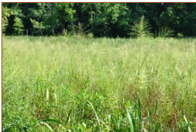
Wetland plants found in Dyke Marsh include Wild Rice ( zizania aquatica ).

The current list (along with historic lists and other information) can be found at http://rsgisias.crrel.usace.army.mil/NWPL/ . Lists can be downloaded by state or by region. State lists may encompass multiple regions—for example, the list for Virginia has columns for both the Atlantic and Gulf Coastal Plain (AGCP) and Eastern Mountains and Piedmont (EMP) regions.