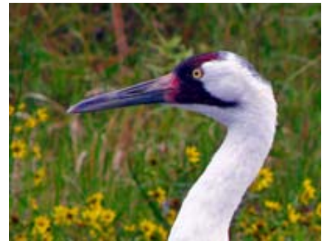
North America's tallest bird, the Whooping Crane, is recovering through restoration efforts.

Whooping Cranes are North America's tallest bird, a species that was nearly wiped out when, in 1941, there were only around 22. In 1967, the Whooping Crane was listed as endangered. Through resto-