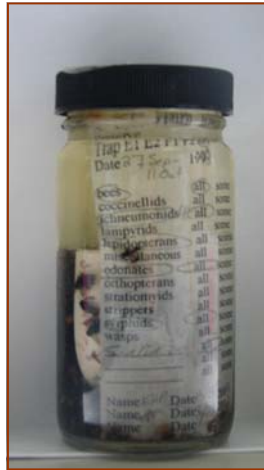
The last jar sorted.