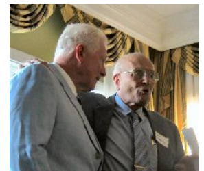
Rep. John Dingell (right) with Rep. Jim Moran.

Congressman John Dingell (D-MI) authored the bill in 1959 that added the Dyke Marsh Wildlife Preserve to the National Park Service system. In June, he became the longest-serving member of Congress in history on his 20,997 th day as a representative (57 yrs., five mos. and 26 days of service), past the record by the late Sen. Robert Byrd (D-WV).