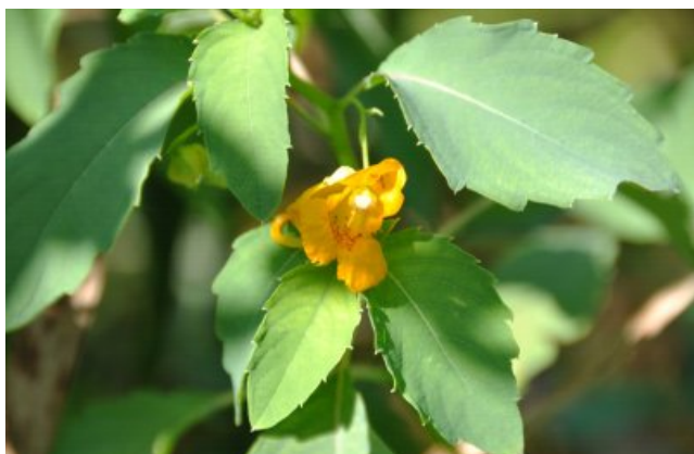
A plant species usually occurring in uplands is the Jewelweed ( impatiens capensis ).

According to the question-and-answer document accompanying the announcement, no major changes to wetland delineation boundaries are expected as a result of the update. The update did result in changes to the indicator status for 12% of the species on the 1988 list, but there was nearly an equal split between species that received “wetter” ratings and species that received “drier” ratings.