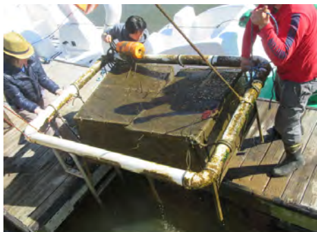
Biologists pull up the suspended mussel cages from the river.