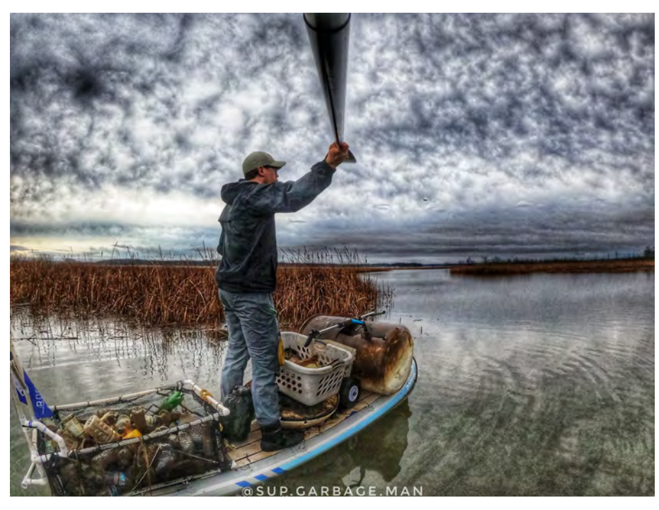
SUP Garbage Man out in Dyke Marsh.

He's found a motorcycle seat, a pregnancy test, a stop sign, IV bags, a drone and a vial of blood, for example. "As for my territory, my efforts have no boundaries," he says. "I've cleaned waterways between Washington, D.C., and the Florida Keys. My mission isn't tied to any river or area in particular. Instead, it's all waterways. I primarily clean this area only because I happen to live a couple miles from the Potomac and it happens to have a lot of trash. Locally, I mostly go anywhere between Mount Vernon Roosevelt Island."