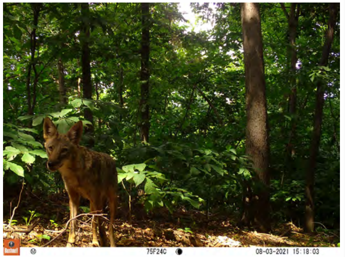
Daytime photo of coyote (Canis latrans)