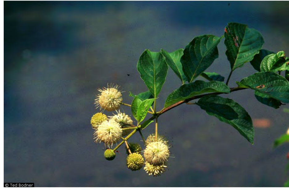
Close-up of buttonbush (Cephalanthus occidentalis)