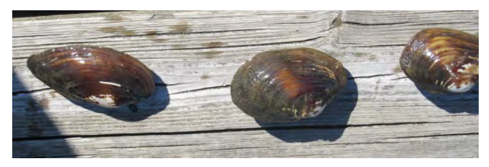
Left to right: eastern pond mussel ( Ligumia nasuta ); eastern lamp mussel ( Lampsilis radiata ); tidewater mucket mussel ( Leptodea ochracea )

While the river is making progress, in their 2020 report, the Potomac Conservancy, concluded, ". . . excess nutrients and sediment from polluted urban runoff is increasing over time and threatens to undo decades of progress. . . sediment in urban and suburban stormwater runoff continues to increase."