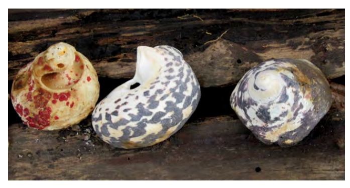
Shells found in Dyke Marsh.

For too many years, wetlands were considered to be dump sites for everything from tires to tea kettles. We thought those days were over, but on March 19, I found some mysterious, exotic shells, coral and rocks which seemed deliberately placed all together behind a log and covered with leaves near the Haul Road trail. Perhaps someone dumped their aquarium's contents there. Another person found what seemed to be drug paraphernalia. If you see suspicious activity or someone discarding things, notify the Park Police at 202-610-7500.