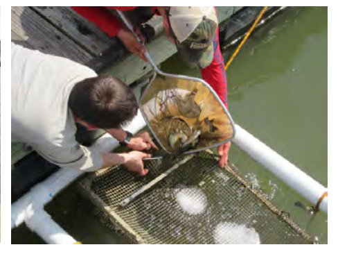
Project participants put fish carrying microscopic mussel larvae into cages.