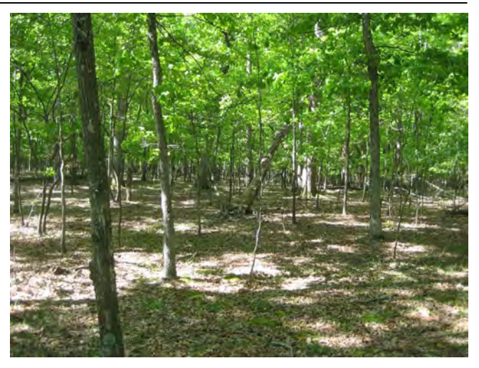
Deer ravaged forest stand, Fairfax VA.

Immuno-contraception and sterilization are not effective on open deer herds. Simply put, you cannot sterilize enough does and deer move around a lot. The few studies that have been conducted (Fire Island and the National Institute of Standards and Technology) involved well-funded operations sterilizing closed herds (fenced and/or on an island) where migration could be controlled. Although those studies showed the ability to control the total number of deer, the resulting populations were still excessive and none of those studies