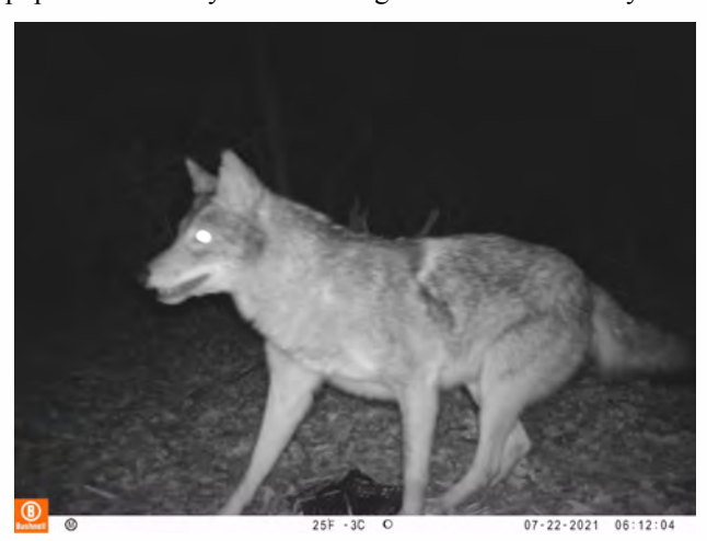
Nighttime photo of coyote ( Canis latrans)

Coyotes long ago crossed the Mississippi River and are now found throughout the eastern U.S., including Northern Virginia. Despite the urban landscape, coyotes persist. In fact, scientific research suggests coyotes can thrive in cities and that coyotes in urban areas can have longer life spans than those in rural areas. Scientists have studied large populations of coyotes in Chicago and New York City to