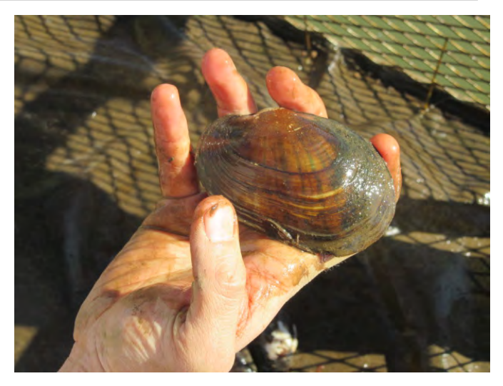
Eastern lamp mussel (Lampsilis radiata)

Mussels draw in water with their incurrent siphon and discharge it through their excurrent siphon. Their shells are usually, but not always, dark in color on the outside and pearly on the inside. Mussels grow in both freshwater and saltwater. They spend much of their lives partially buried in sediment.