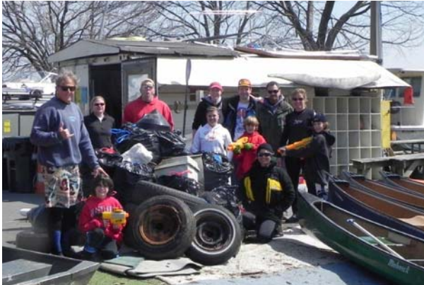
Surfriders DC after the clean up.

From Eagle Scouts to Surfriders, we've had many volunteers out in the Dyke Marsh Wildlife Preserve this spring. On March 26, members of Surfriders DC came out in 4 canoes, 3 kayaks, and one stand-up paddleboard to clean up the Dyke Marsh shoreline, and came back with a mountain of bags and tires. When 600 Carl Sandburg Middle School students visited in April, FODMers helped. Two cleanups brought out young and old. We always need more, especially people to help with controlling invasive plants. Contact Ned Stone at nedstone@verizon.net if you can help.