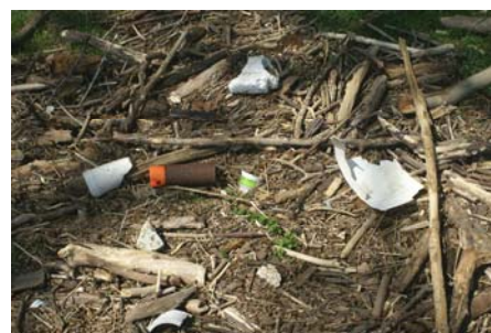
The Dyke Marsh shoreline is littered with polystyrene.