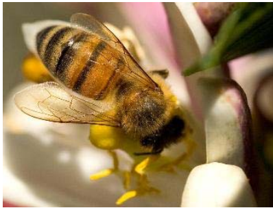
This bee pollinates a lemon tree.