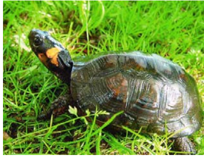
The Bog Turtle is a “threatened species.”

One such species experiencing a decline is the Bog Turtle. One of North America’s smallest turtles, it is only 3-3.5 inches long. The head features a yellow or orange patch. Protected under the Endangered Species Act, it faces several threats to its existence, mainly through loss of its wet-