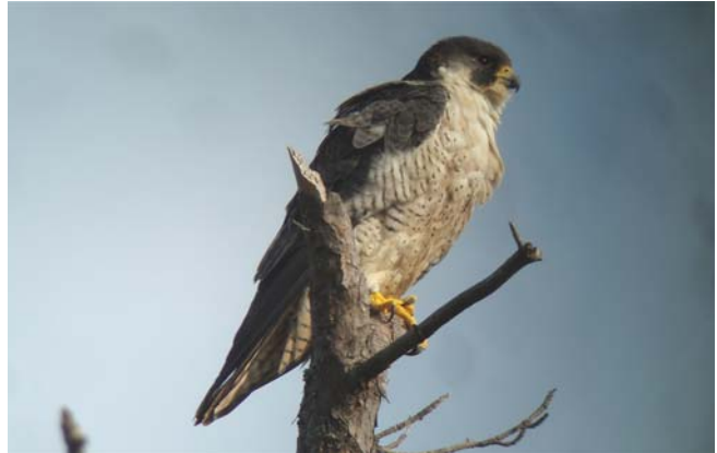
Peregrine falcons, like this one near the Wilson Bridge, seem to be increasing in the area.