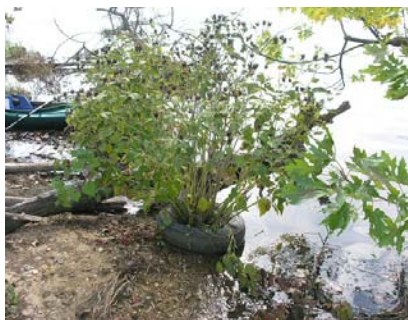
This removal-resistant car tire was on the shore of the island opposite the viewing platform at the end of the footpath.

Being an official Trail Patroller requires two sessions of training. NPS Ranger Georgeanne Smale conducts the training. Eventually, I will get to