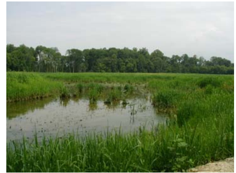
View of a Woodrow Wilson Bridge Project wetland mitigation site (Prince William County, Virginia) on the Silver property. This site has been completed and is in the five-year monitoring phase.