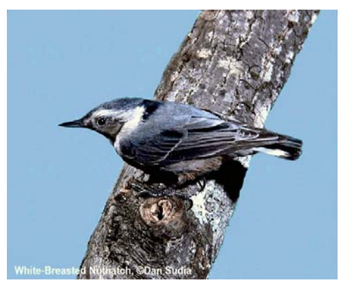
A White-breasted Nuthatch nest was recorded for the first time at Dyke Marsh.

was successful, although the boat remained docked at the marina well into July.