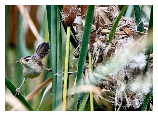
Adult Marsh Wren at the nest.

wintering grounds in the southern United States and central Mexico, Marsh Wrens begin to arrive in the Dyke Marsh area as early as mid-April. Other Marsh Wrens flocks continue north to British Columbia to breed and some stay as far south as Mexico and Florida. Brackish and freshwater marshes, the banks of tidal rivers, and the shores of inland ponds are preferred breeding habitats. Each male wren may have a number of mates which he attracts by fluffing his feathers, cocking his tail over his back, and flapping his partly-folded