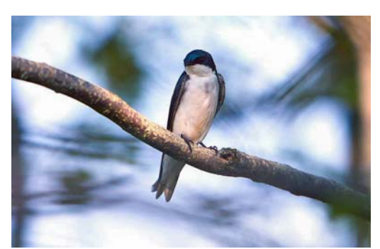
May is the month for Tree Swallows to find cavities for nest building.

September - Southbound migration is into full swing with songbirds and waterfowl populating the various habitats.