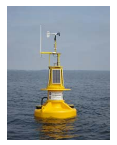
A "smart buoy" collects Potomac River data.

Have you noticed the bright vellow buoy out on the river just south of the Woodrow Wilson Bridge? It is a "smart buoy," part of the National Oceanic and Atmospheric Administration's Chesapeake Bay Interpretive Buoy System and part of a series of buoys placed along portions of the Captain John Smith Chesapeake National Historic Trail. The solarpowered buoy collects