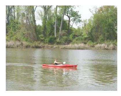
A kayaker enjoys exploring Dyke Marsh.

NPS will be offering a Paddle With a Ranger program in Dyke Marsh on Saturday, November 20. The program begins at 9am and ends at 3pm (it includes a lunch break and restroom breaks).