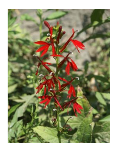
Cardinal flower blooms at shoreline in Dyke Marsh.