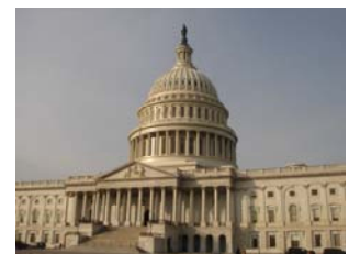
The United States Capitol

"Congratulations to the Friends of Dyke Marsh on your 40th anniversary. I am sorry that I could not be with you today to celebrate this important milestone. Forty years ago, we came together to set aside this land for future gener-