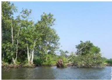
The erosion and fragmentation of Dyke Marsh continues as restoration awaits.

The basis of the current plan for restoration in Dyke Marsh is engineering studies conducted in 2010 and 2013 by a team of scientists from the U.S. Geological Survey led by Dr. Ronald Litwin. The 2013 study: "We ultimately conclude that Dyke Marsh is in its late stages of failure as a freshwater tidal marsh system. . . In the absence of human efforts to restore the equilibrium between marsh and tide, and equilibrium to the other natural forces acting on this