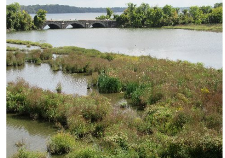
Hunting Creek flows into the Potomac River and despite this vegetation, is in poor condition.

Hunting Creek is an embayment of the tidal Potomac River located just downstream of the city of Alexandria and the I-95/I-495 Woodrow Wilson Bridge. This embayment receives treated wastewater from the Alexandria Renew Enterprises wastewater treatment plant and inflow from Cameron Run, which drains most of the cities of Alexandria and Falls Church and much of eastern Fairfax County.