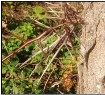
Cluster of honey locust thorns

The genus name Gleditsia honors Johann Gottlieb Gleditsch, an 18th century German physician, botanist, and correspondent of Carl Linnaeus. Triacanthos ("tri" meaning three and "acantha" from the Greek for thorn) refers to the fact that the thorns can be either solitary or three-branched.