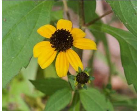
Brown-eyed Susan ( Rudbeckia triloba)