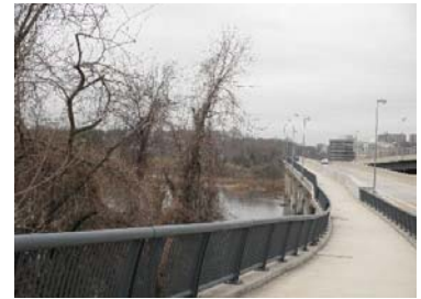
Buildings and roads now sit on former wetlands around Hunting Creek.