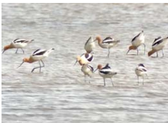
Migrating American avocets feeding on the Hunting Creek mudflats.

Despite the creek's condition, E-bird calls the area a "birding hotspot." The Hunting Creek embayment is a favored stopover for fall migrating shorebirds and is a gull roosting site. A bald eagle pair has nested nearby for at least the past two years. Some species observed there are Wilson's storm petrel, band-rumped storm-petrel, common golden-eye and red-headed woodpecker. It is also the site of Virginia's first ever wintering yellow warbler and a location where often other unusual winter birds like Nashville warbler and Lincoln's sparrow are seen.