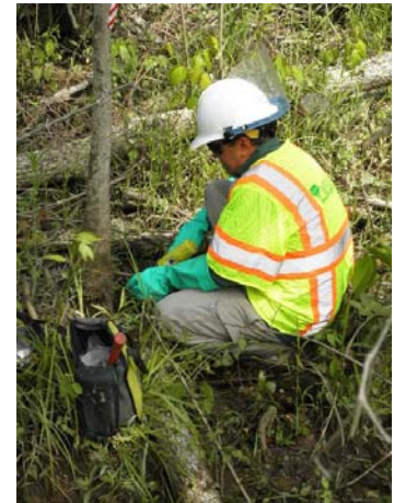
FODM is supporting work to treat and save 16 pumpkin ash trees ( Fraxinus profunda ) in Dyke Marsh.

There's also some cautious good news about our pumpkin ash project. Led by Robert Smith, we have worked with NPS/GWMP since 2015 to try to save some of the pumpkin ash trees ( Fraxinus profunda ) that are being killed by the emerald ash borer ( Agrilus planipennis ), an invasive insect. We treated 16 trees and this fall, all of the treated trees leafed out and all six of the female trees produced seeds. Most of the other ash trees near the treatment site are dead.