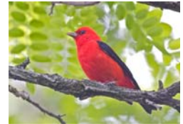
Male scarlet tanager.

Our Sunday morning bird walk leaders are now posting observations from the walks in eBird, creating a continuing electronic record of birds identified at Dyke Marsh. FODM is also using eBird to store and manage data from the Dyke Marsh Breeding Bird Survey.