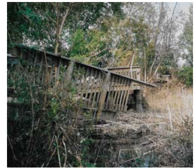
Restoration could attenuate marsh damage like from Hurricane Isabel.

buffering effect of wetlands on storm damage should be considered. At the time of Isabel's impact on the flooded Fairfax communities Dyke Marsh was only a remnant of its prior extension. The proposal to restore the promontory and initiate partial restoration makes sense to attenuate potential damage from coastal storms as well as to conserve a valuable ecosystem. -- Ed Eder, FODM