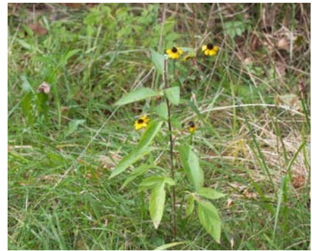
The brown-eyed Susan has tri-lobed leaves near the bottom of the plant.