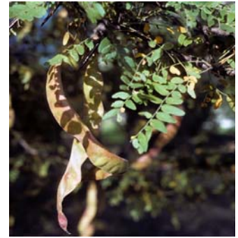
Honey locust leaves and seed pods.

The long, flat, twisted seedpods develop in late summer and early fall, turning from reddish green to purplish brown as they mature and persisting into winter. The pods contain a number of shiny oval-shaped brown seeds as well as the sweet, honey-like pulp that gives the plant its common name. Native Americans in what is now the southeastern US used the pulp from the pods, dried and ground, as a sweetener.